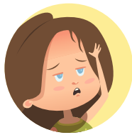
Shakiness and dizziness