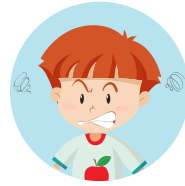
Irritability or moodiness