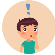
Inability to concentrate and confusion