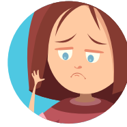
Anxiety or nervousness